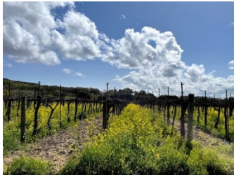
Quarry Hill Vineyard Sonoma Valley

Planted in 1993, Quarry Hill Vineyard recently received certified organic status in 2023. Planted to 100% Cabernet Sauvignon (Clone 8 on 110 rootstock) this vineyard is a fantastic addition to our vineyard partner portfolio. It's Gouling soils that are excessively well drained produce Cabernet Sauvignon that is rich, concentrated and bold.