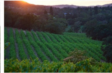
MacLeod Family Vineyard Kenwood, Sonoma Valley

Cameros Highway Pinot Noir Cameros Highway Chardonnay