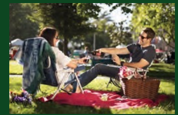
Sonoma Valley lifestyle

Our wines are crafted from California's most iconic vineyards adjacent to Highway 12, California's wine highway.