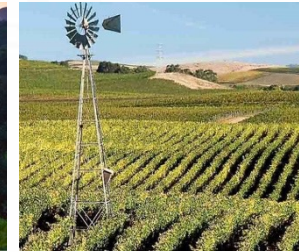
La Prenda Vineyard Clarksburg