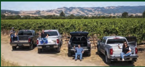
Friendly owned winery