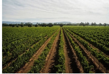
Sangiacomo Vella Vineyard Sonoma/Carneros

Cameros Highway Chardonnay Sonoma Highway Chardonnay