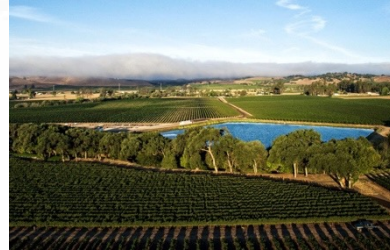
Sangiacomo Kiser Vineyard Sonoma/Carneros

Highwayman Reserve Cabernet Sauvignon Highway 12 Reserve Red Blend Sonoma Highway Cabernet Sauvignon