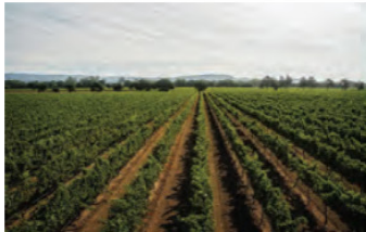
Sangiacomo Green Acres Vineyard Sonoma/ Carneros

Carneros Highway Pinot Noir Carneros Highway Chardonnay