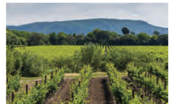
Sangiacomo Vella Vineyard Sonoma/ Carneros

Planted in 1997, Vella Vineyard is one of the Sangiacomo's biggest vineyards and was the first of their vineyards to be planted with newer French clones and rootstocks. Soils are Zamora silty loam and Wright loam. The vineyard is planted with fifteen combinations of clones and rootstocks.